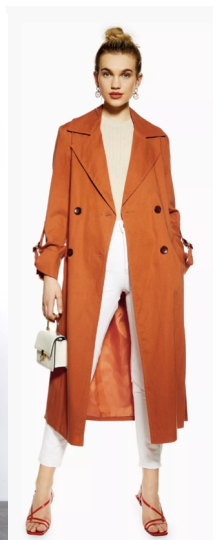
Topshop | $130