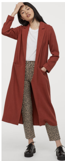
H&M | $39.99

Kohl's | $75 retail → $49.99 on sale → $39.99 w/ 20% off coupon