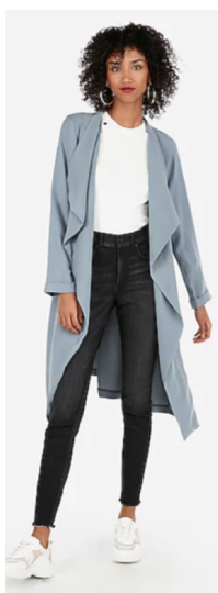
Express | $128